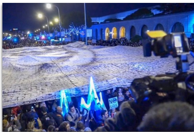
Marchers carry the flag in Madrid

COP26 is the biggest climate summit ever and it will bring together over 30,000 people including world leaders, climate experts and campaigners to agree on how the world can work together to tackle climate change. This means that the most important people from almost every country in the world are getting together in Glasgow to tackle this global crisis. The hope is that they can together decide on targets and regulations which will help us prevent further damage to the planet. Read more about COP26 here .