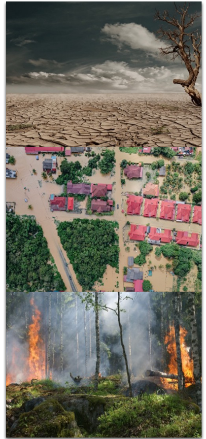
Damage around the world, due to climate change