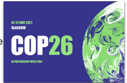
COP26 is happening in Glasgow in 2021